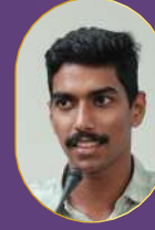
AJITH P AIR 714