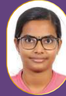
LAKSHMI MENON V AIR 477