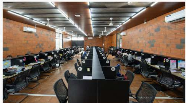
AC READING ROOM FACILITY