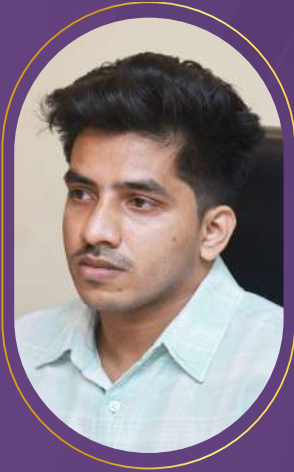
A Rashid Ali AIR 840