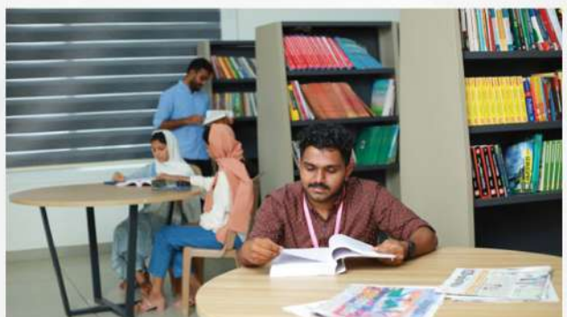
COMPREHENSIVE LIBRARY RESOURCES