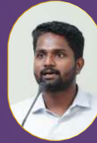
AMAL PV AIR 661